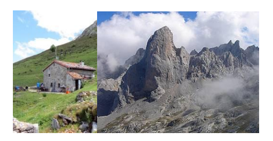
Route 2: Sotres- Collado de Pandebano - Canal del Tejo - Refugio La Tenerosa

This circular walk takes us on a route that combines high pastures of the Collado de Pandebano, to the Refugio Tenerosa & the base of the icon mountain of the Picos – Naranjo de Bulnes (Pico de Uriellu 2,529m), first scaled in 1904 by local shepards & Marques de Villaviciosa